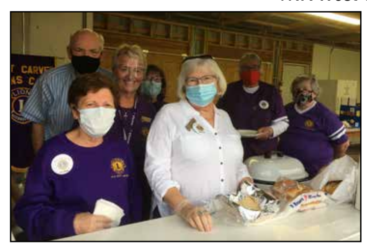
ABOVE: The NYA West Carver Lions hosted National Night Out in Norwood Young America on Tuesday, Oct. 6, 2020.

RIGHT: NYA West Carver Lions and NYA Lions hand out dictionaries to third graders at Central Elementary and St John's Lutheran School NYA.